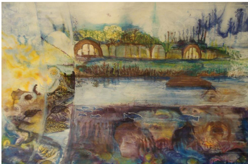
„the waves of happiness” 70x50cm mixed media, paper

I support the idea with my entire oeuvre.