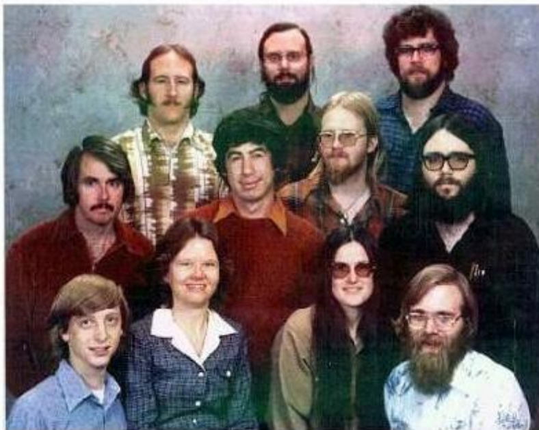
Microsoft Corporation, 1978