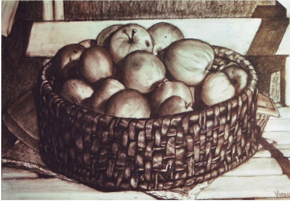
Apple clock charcoal drawing, 1995.