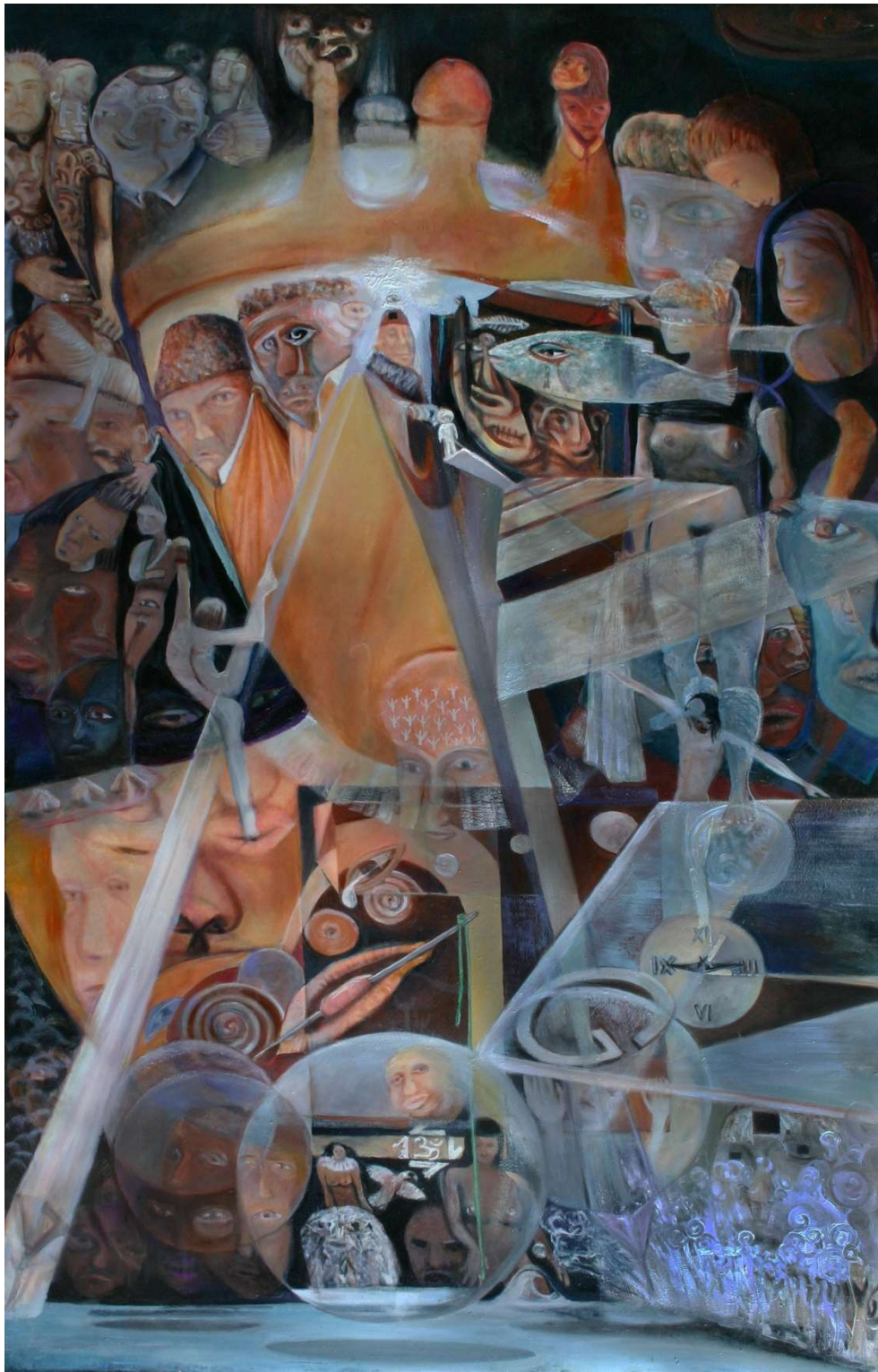
„The crumbling down of the ego supremacy” 90x110cm oil on canvas 2015.