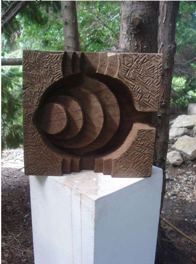
Ears of the World (1975) oak, 40X40X20cm (exhibited in 2010. in my garden gallery)

Unfortunately, despite being only interested in fine arts, I went to a comprehensive high school in the absence of parental support.